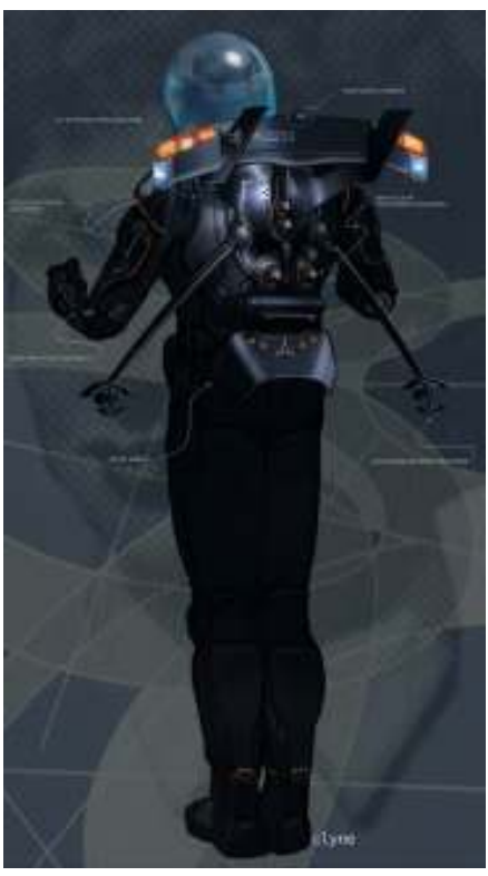
Figure 2: A Hoversuit, a system for rapid individual transport. Despite more than a century of improvements (nanotech engines, AI safety, smart clothing), it is still too dangerous and cumbersome to be in wide use. (James Clyne, Minority Report)

Each dot below 5 represents about 10 years behind cutting edge. This mostly denotes hardtech levels; when it comes to neogenetics Earth is usually one or two steps ahead of space, and in terms of nanotech and artilife Earth is at least two steps behind.