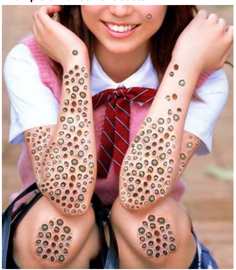
The baby's blood type? Human, mostly. —Orson Scott Card

0 General good appearance Smart or living tattoos 1 Body compartments Synthesize vitamin C Fur